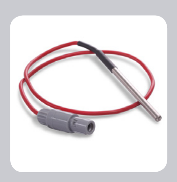
Optional PT 1000 temperature probe

Ordering Information and Specifications*