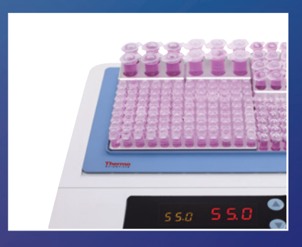
Compact Dry Bath / Block Heater pg 6