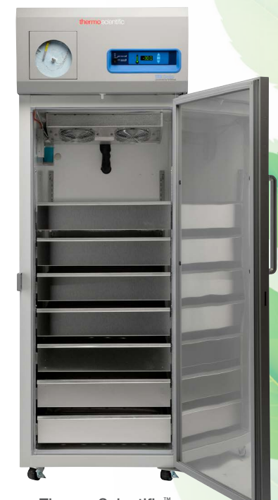
Thermo Scientific<sup>®</sup> TSX 23 cu ft plasma freezer