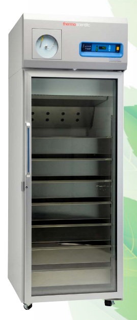
Thermo Scientific™ TSX 23 cu ft blood bank refrigerator