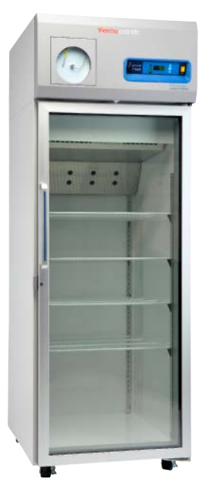
Thermo Scientific<sup>®</sup> TSX 23 cu ft refrigerator