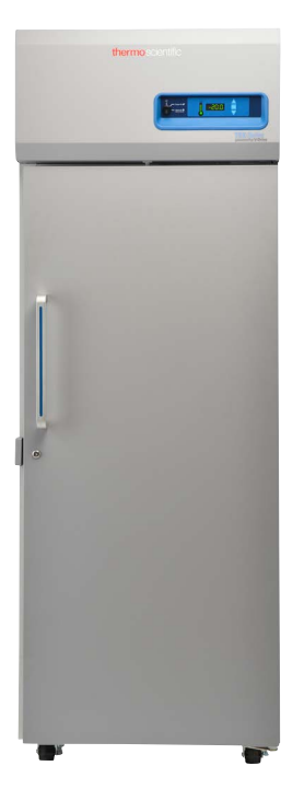
Thermo Scientific<sup>™</sup> TSX 23 cu ft freezer