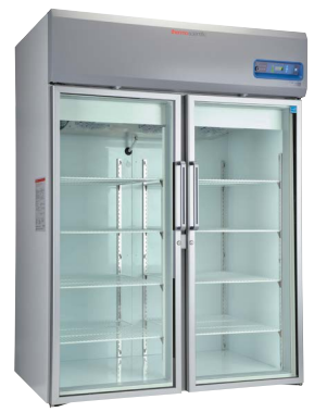
Thermo Scientific™ TSX 50 cu ft Refrigerator