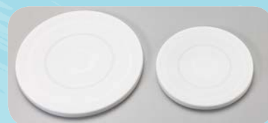
Non-slip Silicone Plate Covers