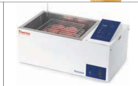
Thermo Scientific Precision 260 Circulating Water Bath with optional Petri dish rack