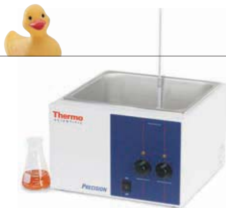
Precision 183 Analog Water Bath