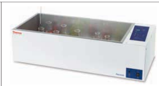
Thermo Scientific Precision 270 Circulating Water Bath