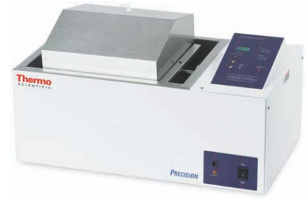
Thermo Scientific Precision Dubnoff Shaking Bath with large gassing hood

Our Precision Dubnoff Reciprocal Shaking Baths are designed specifically for applications that require your samples to be incubated in a controlled atmosphere. This bath has a capacity of 14.5 liters (3.9 gallons), and has a depth of 3.5 inches (8.9 cm). One large and two small gassing hoods are included with each bath along with the gable cover. An optional 3-gas (oxygen, nitrogen, and CO 2 ) flowmeter is available for precise control of the atmosphere surrounding your important samples.