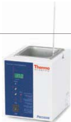
Precision 281 Digital Water Bath with optional thermometer