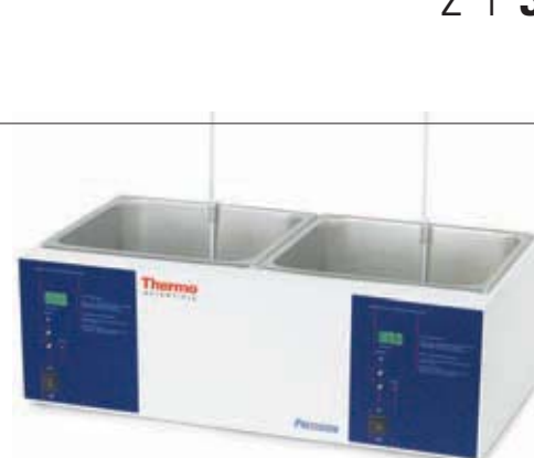
Precision 288 Digital Water Bath with optional thermometers