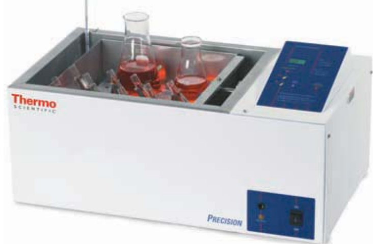
Thermo Scientific Precision Shallow Form Shaking Bath with optional thermometer

Our Precision Shallow Form Reciprocal Shaking Baths have a capacity of 14.5 liters (3.9 gallons), however the removable tray provides a depth of only 3.5 inches (8.9 cm) for use with smaller sample containers. This bath can be equipped with optional 3-gas (oxygen, nitrogen, and CO 2 ) flowmeter and gassing hoods.