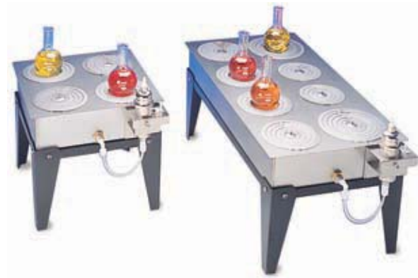
Thermo Scientific Precision Concentric Ring Electrical Steaming Baths

Our Precision Concentric Ring Electrical Steaming Baths are designed to gently warm samples, make concentrates, and melt solids such as agar. Available in both 4-opening and 8-opening models, they accommodate various sizes of glassware and evaporating dishes, including round-bottom flasks. Flange-formed stainless-steel rings nest smoothly and become progressively larger as each concentric ring is removed. Copper-clad immersion heaters provide bath temperatures up to 100°C. These baths require hardwire installation by a qualified electrician and need to be hooked up to a continuous water source.