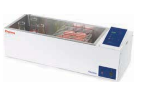
Thermo Scientific Precision 265 Circulating Water Bath with optional Petri dish rack