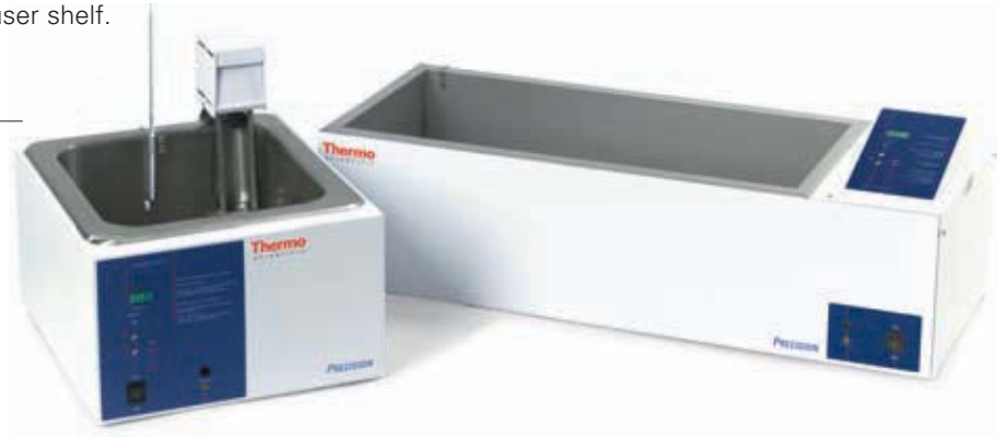
Thermo Scientific Precision Coliform Water Baths

Our Precision Coliform Baths Models 251 and 253 are designed specifically for fecal coliform determination. Each bath is factory calibrated and can be field calibrated from the front panel without the use of tools. The preset temperature feature is standard on both coliform baths for ease of use. Both baths meet stringent performance requirements. The Model 251 comes with a seamless chamber and the Model 253 comes with a larger-welded chamber. Free stainless-steel gable cover and diffuser shelf. Free stainless-steel gable cover and diffuser shelf.