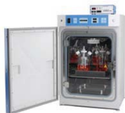
Used in CO 2 Incubator Page 10