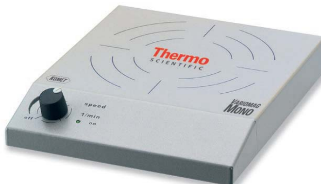
Variomag Mono Direct

Operating conditions are -10 to +40°C at 95% rH 100-240 V units contain a cord set with various plugs