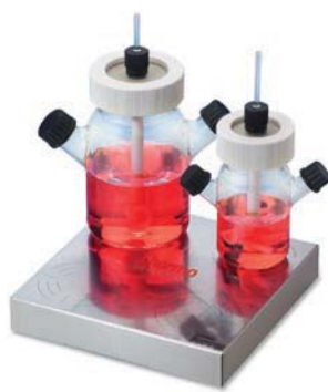
Variomag Biosystem 4