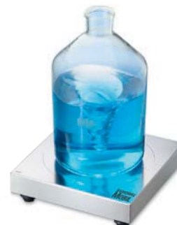
Variomag Mobil Direct

Disc motor-drive stirrers Pages 11 to 13