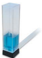
Stir Tiny Cuvettes Page 2