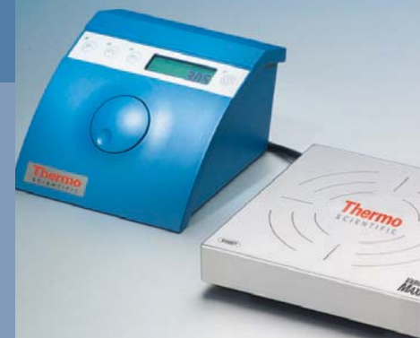
Variomag Maxi with Telemodul 20 C