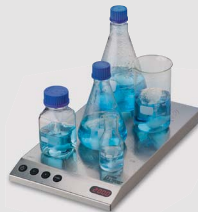
Variomag Multipoint 15