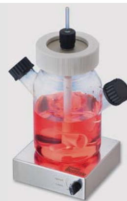
Variomag Biosystem Direct