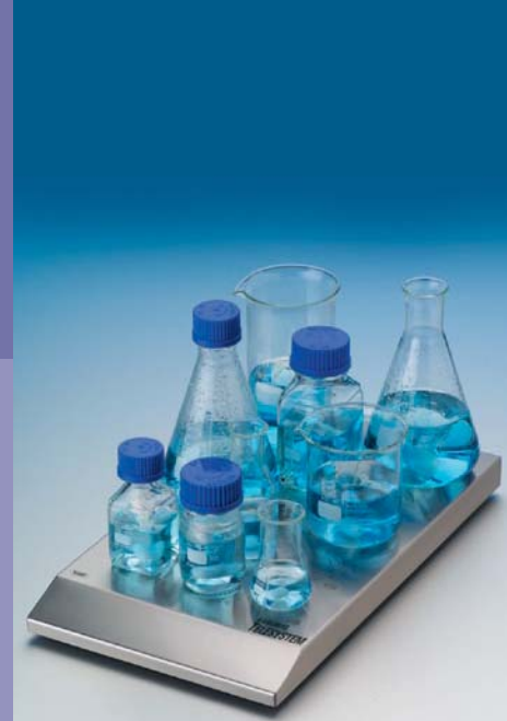
Variomag Telesystem 15