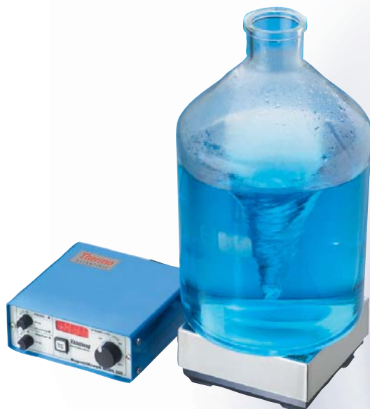
Variomag Mobil 200 with Telemodul 40 M

Operating conditions are -10 to +56°C at 100% rH