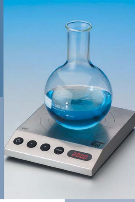
Variomag Maxi Direct