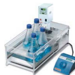
Submersible in 50°C Bath Pages 5 and 7