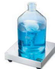
Stir 600 L Carboys Page 12