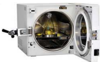
Used in Sterilizers at 121°C 2 bar Pressure Page 11