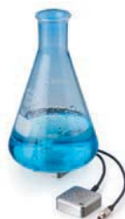
Submersible in 95°C Bath Page 3