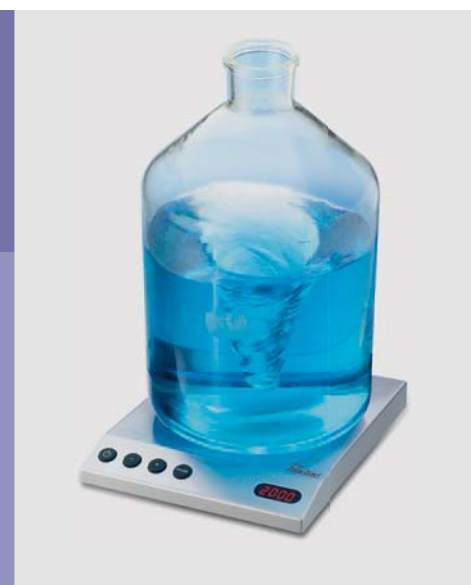
Variomag Power Direct