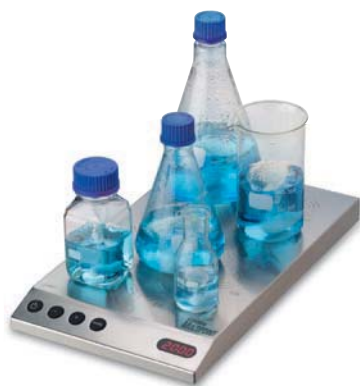
Variomag Multipoint 15