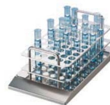
Stir 60 Positions Simultaneously Page 9